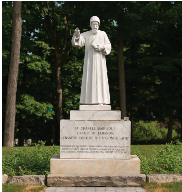
This statue of St. Charbel Makhlof is the centrepiece of Beechwood's Lebanese cemetery.

Inaccurately regarded as Ottawa's Anglo-Protestant cemetery, Beechwood has always reflected Canada's identity as a multicultural, multi-faith society. It always took in whoever needed its services