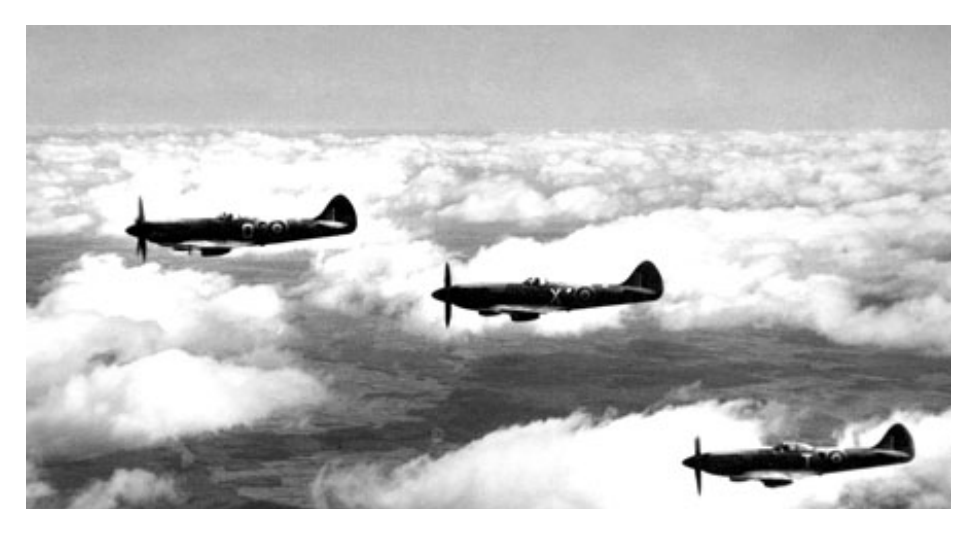
Three Spitfires, with RCAF markings visible, flying over France.

Journeying beyond its birthplace, The Canadian Shield Defender made its way to Ottawa, the nation's capital, where it found its final resting place alongside boulders representing other nations at the National Military Cemetery. Here, amidst the solemn grounds dedicated to honoring the fallen, the Defender stood as a testament to the enduring bonds of friendship and cooperation forged in the crucible of war. Forever enshrined among comrades from around the world, The Canadian Shield Defender's legacy lives on, a silent defender of Canada's proud military heritage.