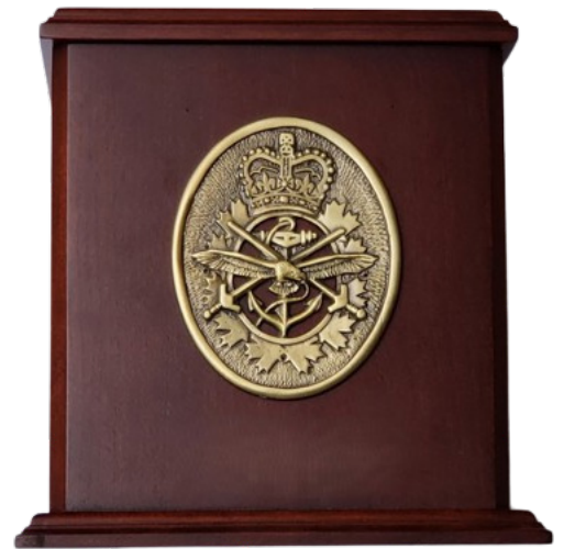
RCMP, CSIS or Canadian Armed Forces Regimental Barn & Stable Urns Solid Oak or Cherry (8 1/4" w x 8 1/2" d x 10 1/2" h) $ 895.00

All urns listed are standard adult size.