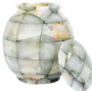
Triumph Onyx Green