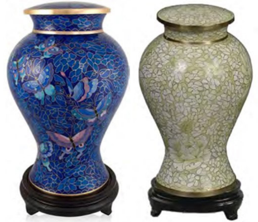
Elyse Cloisonné Blue Eckels 160L - Opal Eckels 162L Highly polished cloisonné urn in assorted hues (7" d x 11" h) $ 825.00