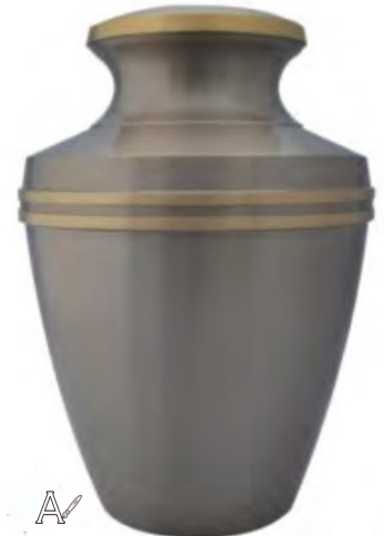
Odessa Pewter Eckels QB512L Custom spun brass urn with pewter & brushed finish and double band accent (7 1/4" d x 10" h) $ 740.00

All urns listed are standard adult size.