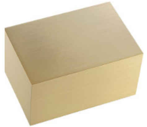
Sheet Bronze Chest Batesville 148341 Sheet Bronze (8 1/2" w x 6" d x 4' h) $ 910.00