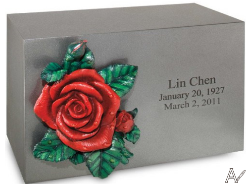
Sand Bronze Vertical Batesville 235601 Bronze (4.44" w x 8.19" d x 9.06" h) $ 875.00