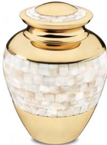
Mother of Pearl Eckels MOP Handcrafted from brass with applied pearl finish (7" d x 9 1/4" h) $ 595.00