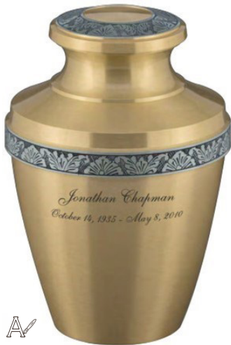
Odessa Bronze Floral Eckels QB511L Custom spun brass urn with bronze & brushed finish and floral band accent (7 1/4" d x 10" h) $ 740.00