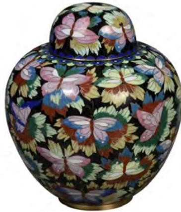
Butterfly Cloisonné Eckels 832 Handcrafted from copper, applied enamel finish (8" d x 9 1/4"h) $ 825.00