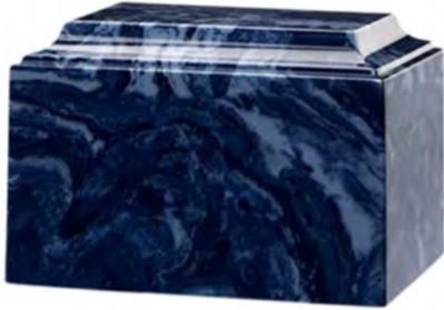
Navy Classic Urn Eckels 213 Cultured Marble (9 3/4" w x 6 3/4"d x 6 1/2"h) $ 455.00

* based upon availability, taxes not included