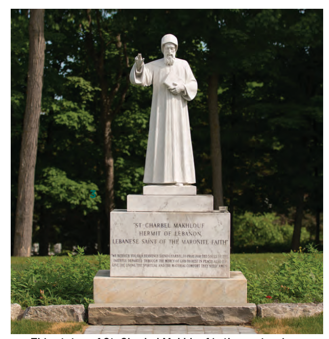
This statue of St. Charbel Makhlouf is the centrepiece of Beechwood's Lebanese cemetery.

Inaccurately regarded as Ottawa's Anglo-Protestant cemetery, Beechwood has always reflected Canada's identity as a multicultural, multifaith society. It always took in whoever needed its services