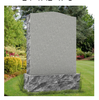
$ 3,650.00 Plus HST

Light Barre Grey monument, Steeled 22" x 6" x 28" -Stanstead Grey base 24" x 12" x 8"