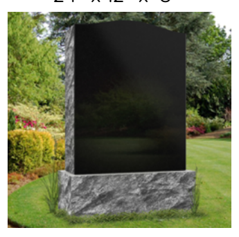
$ 4,650.00 Plus HST

Jet Black monument, polished front and back 22" x 6" x 28" -Stanstead Grey base 24" x 12" x 8"