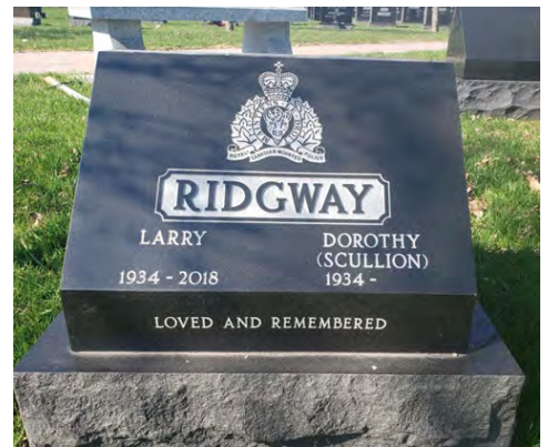
RCMP Cremation Grave Package 4 x 5 Up to 4 urns. (Black Pillow Monument Included)