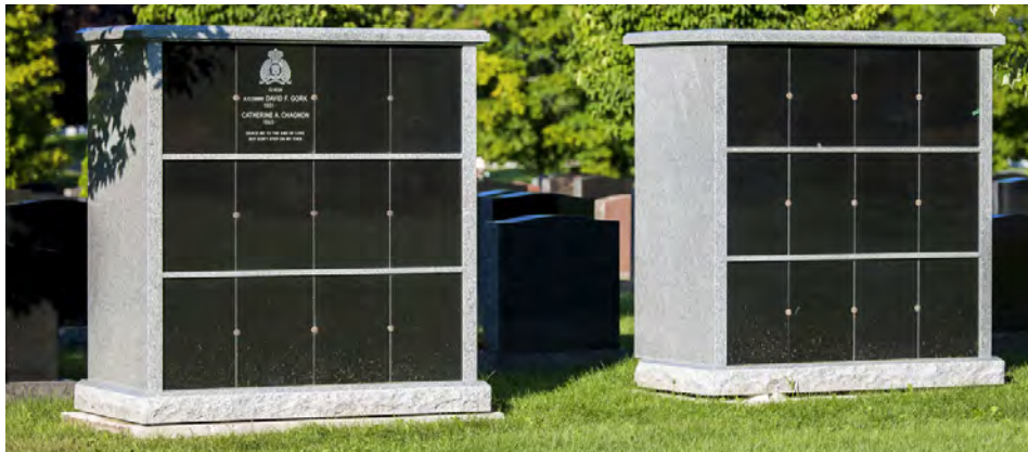
RCMP Niche Up to 2 urns. (Granite plaque *Larger, including inscriptions.